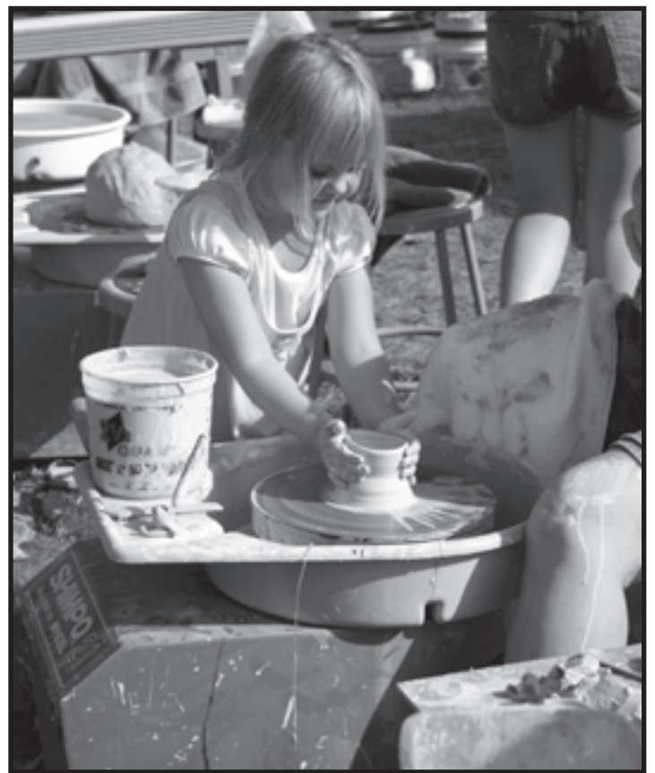
Young visitors to the Museum's annual Fall Harvest Festival in October had a chance to try out a potter's wheel. Members of the Clay Guild were on hand to demonstrate various techniques and to compete in several categories of "clay games."