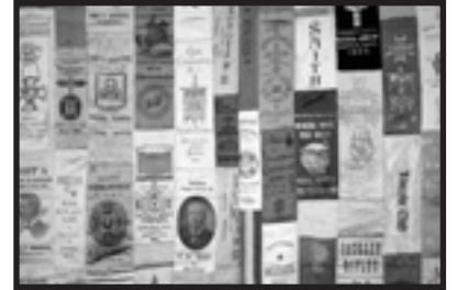
Quilt made entirely of ribbons, c.1904

A special re-exhibition of quilts, coverlets, and their stories from the Museum's textile collection. This very popular exhibit was forced to close in late 2005 after only two weeks of exhibition due to the construction of the new galleries. This is a rare second chance to see this portion of the Museum's beautiful textile collection. Included in this exhibition are the "jilted tailor" quilt, a friendship quilt, and a pieced quilt using scraps from an area corset factory.