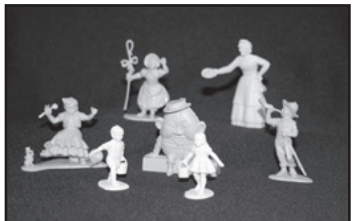
Early plastic toy nursery rhyme figures, 1955. Gift of Dorothy Dyer.

Recent 20 th Century artifacts that have been donated to the Museum include these items from the mid-century: