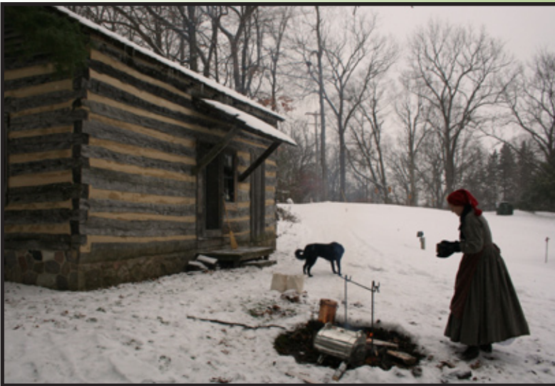
The Museum’s Log House was decorated with fresh greens and a Christmas tree for A Civil War Christmas program on December 6. Visitors enjoyed a hot drink and met a soldier home on furlough and his family.