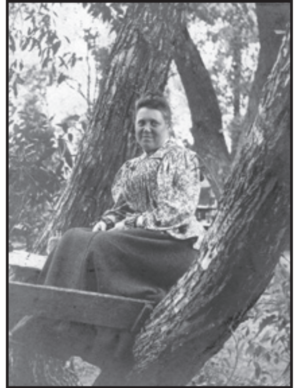
If I don't get out of this tree soon I'll miss Lynne's party!

The pitter patter of little feet fill the Museum studios and galleries during this Pre-School week of tours. Museum staff and volunteers read stories, give tours, and assist with "Make & Take" projects. For many of these little ones this is their very first visit to a Museum-- we're honored to open the doors to a future filled, we hope, with more Museum visits.