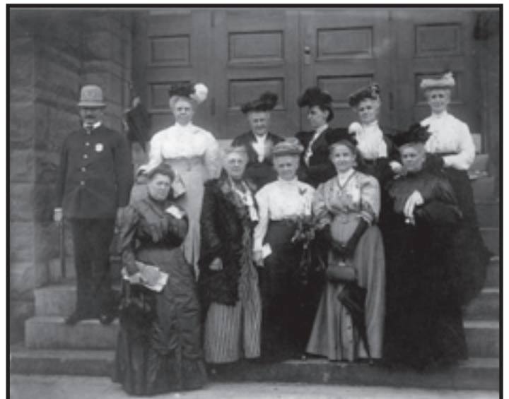
Are we too old to attend the Student Art Symposium?

Celebrate the arrival of Spring! Glimpse into Hillside Farm's past with sheep shearing demos, maple sugaring presentations in the kitchen and woodshed, and a maple pancake buffet in the Granary. Also part of the day: children's art activities and new exhibits, maple products for sale, and other surprises. Admission is free with nominal fees for make and takes, refreshments, and first-floor tours of Ella's house.