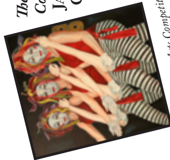
Statewide Fine Arts Competition