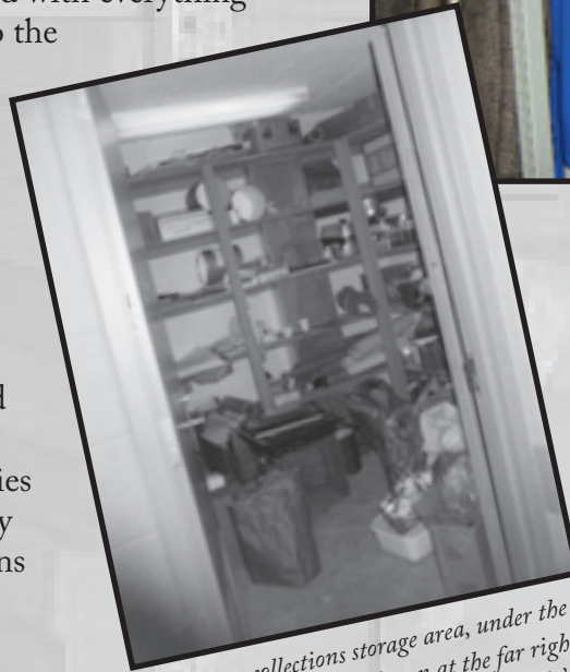
The new collections storage area, under the Museum galleries, is shown at the far right and above. The old storage area, in Ella's Hillside Farmhouse cellar is shown above.